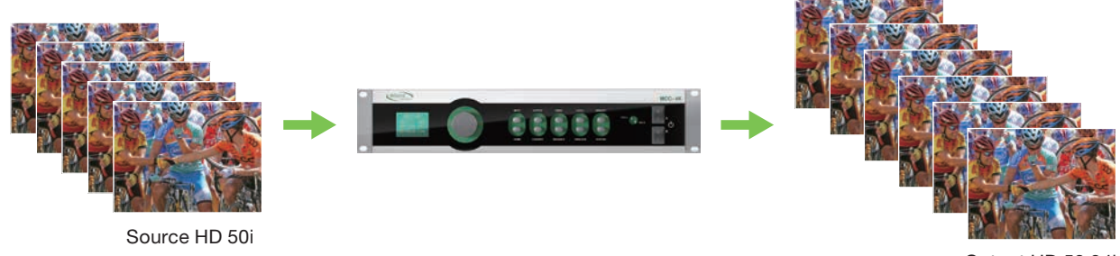
Output HD 59.94i

MCC-4K also operates as an 3G/HD motion compensated standards converter, allowing its rapid redeployment for all conversion applications. Availability of loop-through reference input with genlock phase control, and timecode conversions make the MCC-4K ideal for demanding live production environments.