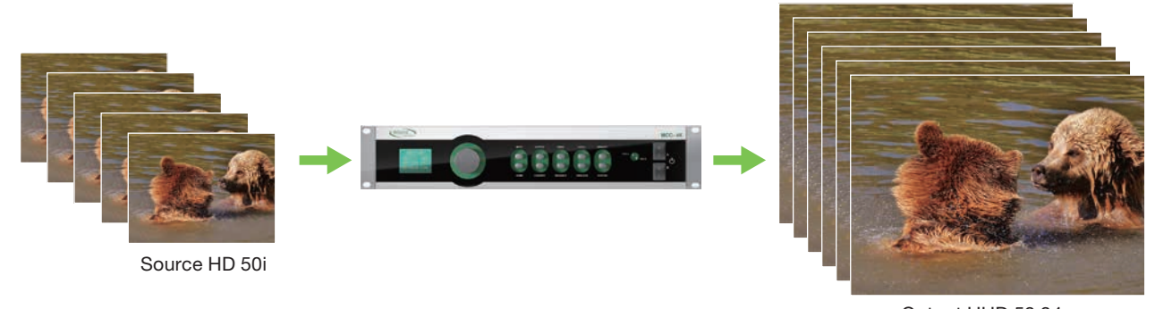
Output UHD 59.94p

MCC-4K is perfect for integrating HD and 3G content into UHD programming. Benefiting from proprietary aperture control for up-conversion with enhancement features, MCC-4K transforms 3G/HD content into superb UHD output, offering simultaneous 4K single link 12G/6G and 4K quad link (2SI and SQD).